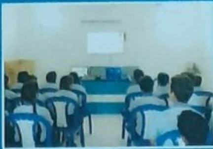
A.C. SMART CLASS