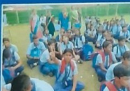
TOUR & TRAVEL