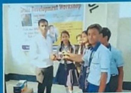
BRAIN DEVELOPMENT PROGRAMME