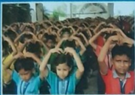
P. T. CLASS